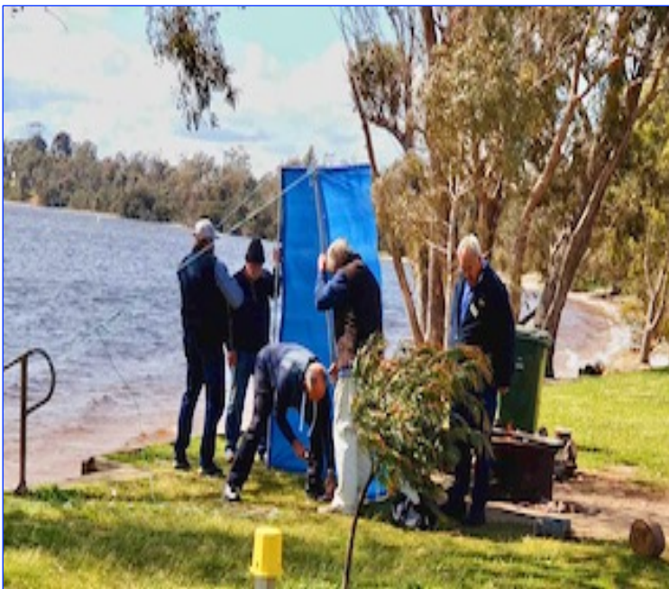
Some of the hazards of Winter Rallies – windbreaks