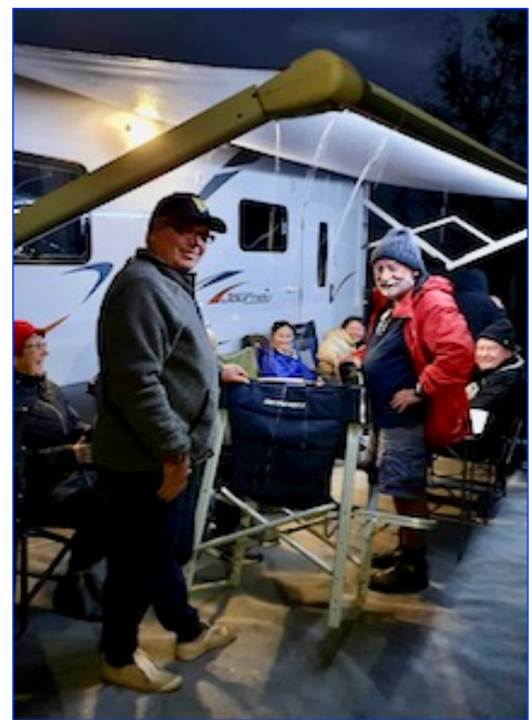
.....and leaky awnings