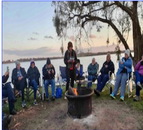
Opening of the Rally